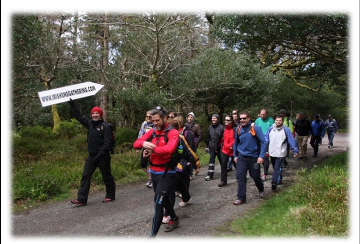
(EMS Gathering Mountain Walk)

Register now on <u>www.emsgathering.org</u> as places are filling up fast. Follow us on twitter @emsgathering and on facebook.