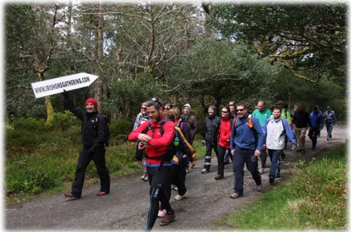
(EMS Gathering Mountain Walk)

Register now on www.emsgathering.org as places are filling up fast. Follow us on twitter @emsgathering and on facebook.